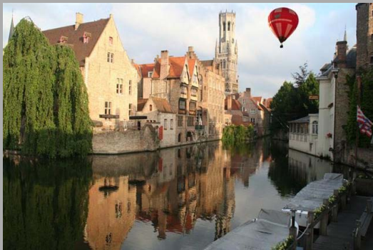
Calm Canal in Brugge Class A - Honorable Mention Murray Lieb