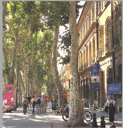
Aix en Provence Class A - Honorable Mention Lew Stoll